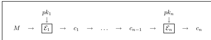
Figure 2: Sequential construction of multiple encryption