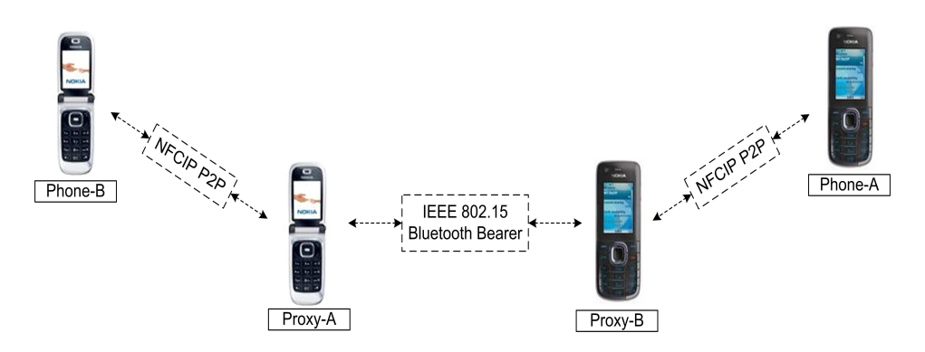
Fig. 1. P2P Relay Setup using Bluetooth.