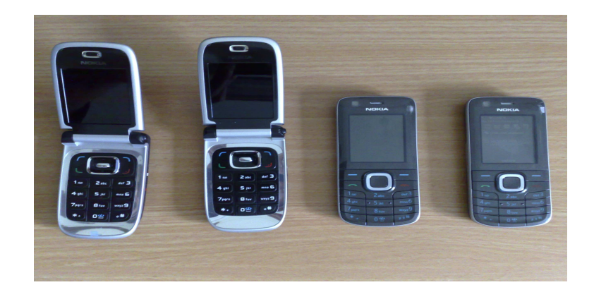
Fig. 2. Devices used in the relay attack – Device B (Nokia 6131 NFC), Proxy A (Nokia 6131 NFC), Proxy B (Nokia 6212 Classic NFC) and Device A (Nokia 6212 Classic NFC).