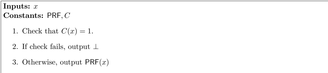
Figure 15: The program P_C .

PRF.Constrain(C) : Build the program P_C in Figure 15. Output iO(P_C) .