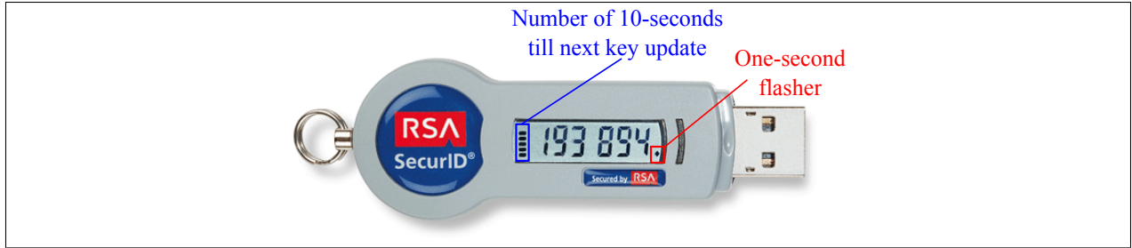
Figure 1. An RSA SecurID® SID800 token with USB connector. The key gets updated every one minute. The small square in the bottom right is a flasher, which blinks once per second. After 10 blinks, one of the bars to the left disappears (actually, the first and last bars disappear after five blinks). When the flasher blinks 60 times, a new key is generated, and six bars are added to the left.

LTK K_{\text{new}} , she will be unable to infer the previous LTK K_{\text{old}} , as doing so requires inverting the one-way function. Since the ephemeral keys depend essentially on K_{\text{old}} , it must be impossible for the adversary to obtain the ephemeral keys from K_{\text{new}} . We will use the term Key-Evolving Schemes (KES) for protocols which update their LTKs at specific occasions. In this paper, we are interested in symmetric KES protocols, where each pair of parties may have a pre-shared symmetric key.