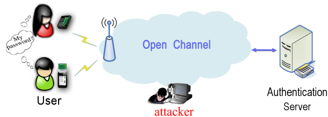
Fig. 2. Smart-card-based password authentication

In this paper, we mainly focus on the most general case of two-factor authentication where the communication parties only involve a single server and a set of users, i.e. the traditional client/server architecture, as illustrated in Fig.2.1. It is not difficult to see that our results in this paper can be applied to more complex architectures where more than one server are involved, such as the multi-server authentication environments [62], the mobile network roaming environments [49] and the hierarchical wireless sensor networks [15].