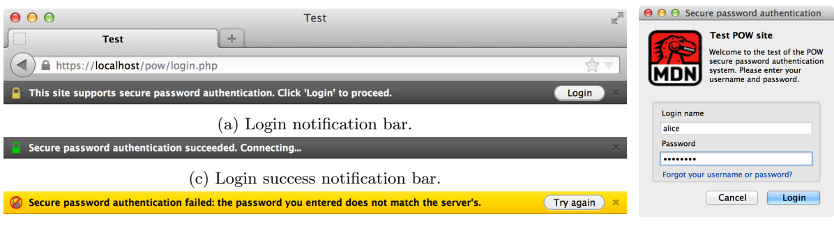
(d) Login failure notification bar.