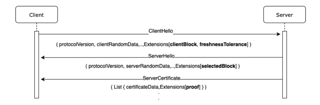
Fig. 3: TLS Handshake Extensions for CertLedger