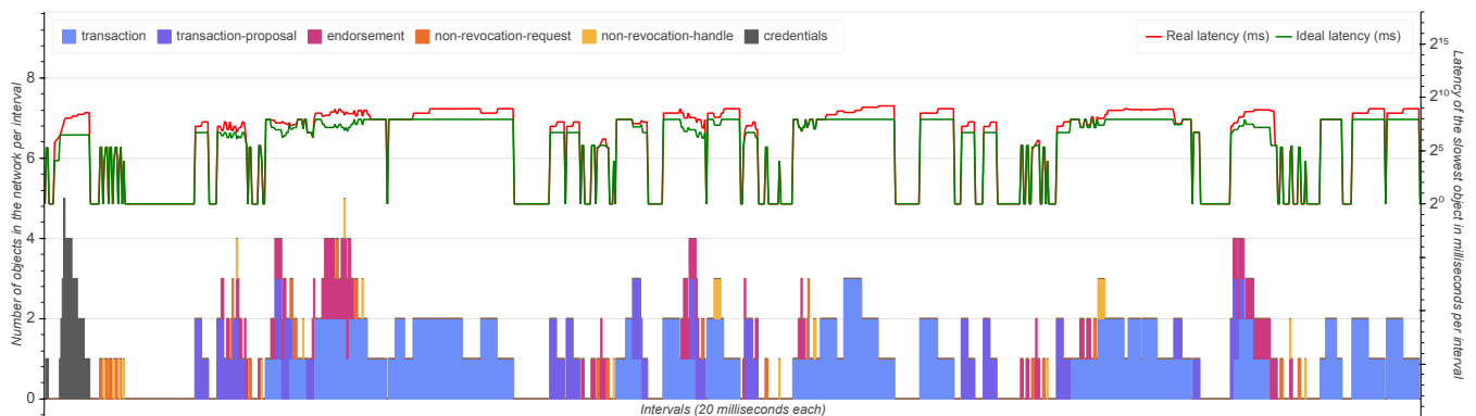
Fig. 3: Network log visualization (subset is shown, 18 transactions). Interval size is 20 ms. Experiment involves 5 users, 3 peers, 2 endorsements, 20 KiB/s and 50 KiB/s local and global bandwidths, and epoch length 5 seconds. Bars show objects in the network, lines show latencies (green for ideal, red for real). Latency scale is logarithmic.

In the transaction phase, all users submit a configured number of transactions. Transactions are submitted sequentially for a single user but in parallel among all users. Users wait a configurable amount of time, sampled from Poisson distribution, before submitting the next transaction. Transaction processing requires executing the chaincode and computing read/write sets, which involves running a Docker container. We model this stage by waiting 50 ms — average time it takes to execute the simplest chaincode. In the auditing phase, an auditor goes over all transactions decrypting the user public keys.